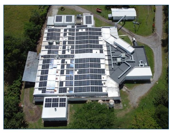
Hy-Line Colombia's state-of-the-art Las Palamas Hatchery utilizes green energy supplied by an array of rooftop solar panels.

Their immense database houses records from millions of layers over the last decade-plus, allowing the technical team to assist customers to evaluate flock performance vs. local production standards and make adjustments to realize the full genetic potential of its Hy-Line genetics under local realities.